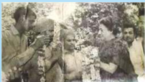
Honoured by Indira Ghandhi (Former Prime Minister of India )